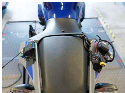
Big data: The finest MotoGP measuring equipment from 2D is also on board for the tyre test