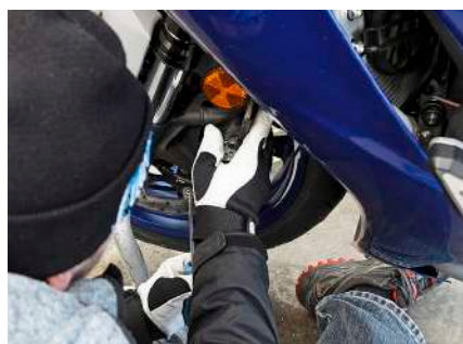
Ch-ch-changes: Tyres out, tyres in. New ones every hour. Piecework in the pit