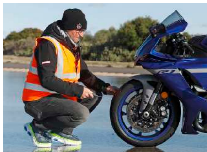
PCR test: P for Prick, C for Celsius, R for Rubber. All tyres in the positive range