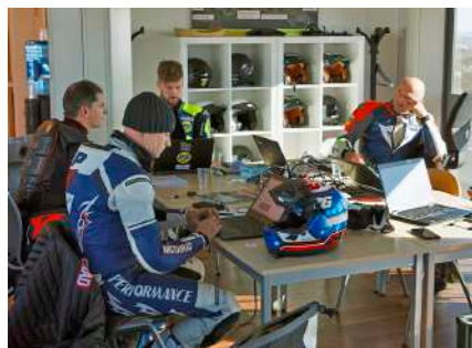
Warming room: Between circuits, the testers come back to operating temperature